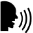
Read or Paraphrase