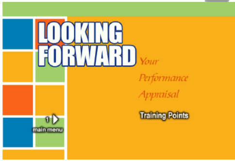
Title Slide 1